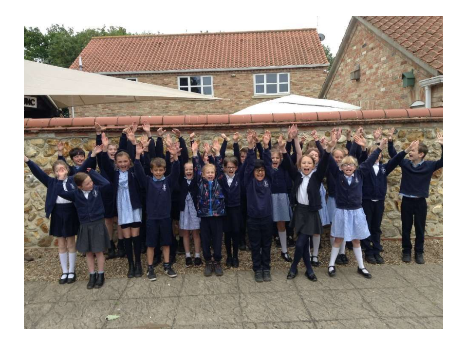
A huge thank you to the Friends for funding this visit.