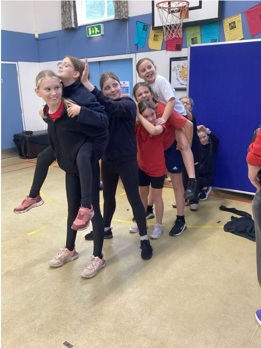
The smiles say it all.

Then the Bible story of Shadrach, Meshach and Abednego was shared with groups representing the scenes of the story where the brave men stood up to the king and refused to idolise him.